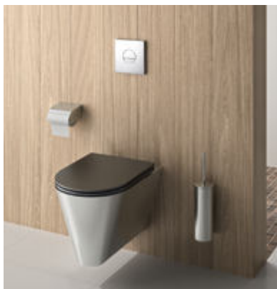
S21 S wall-hung stainless steel designer WC installation example