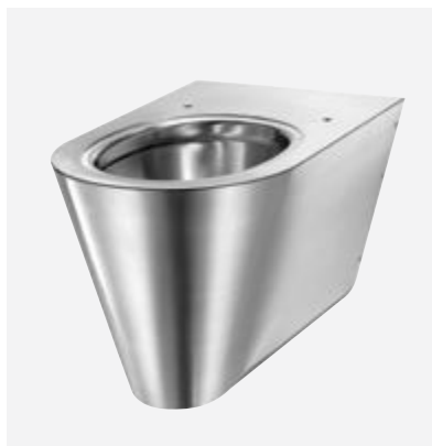
S21 S wall-hung stainless steel designer WC Ref. DELABIE: 110310

Images available on our website delabie.com , in the PRESS section