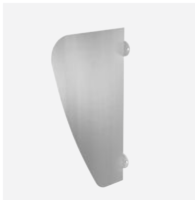
AZA urinal divider Ref. DELABIE: 100620

Images available on our website delabie.com , in the PRESS section