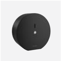
Toilet paper dispenser