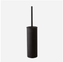
Toilet brush set with lid