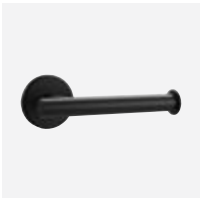
Toilet roll holder, or for spares