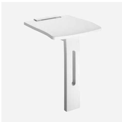
BASIC + shower seat Ref. DELABIE: 510405

Images available on our website delabie.com , in the PRESS section